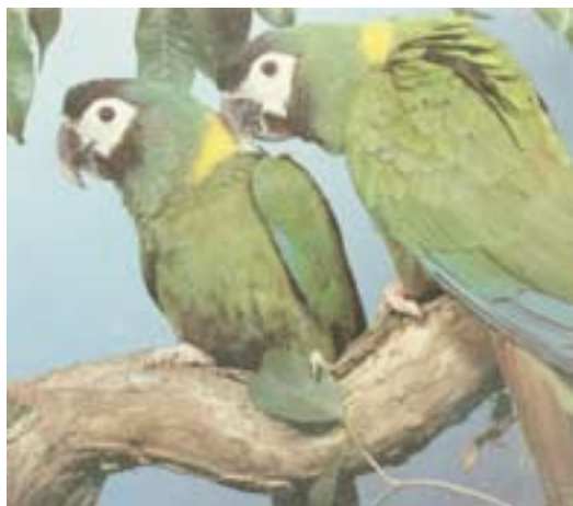
Yellow Collared Macaw

Next meeting To be held in the Sunny Nook Community Centre 148 Sycamore Drive, Sunnynook.