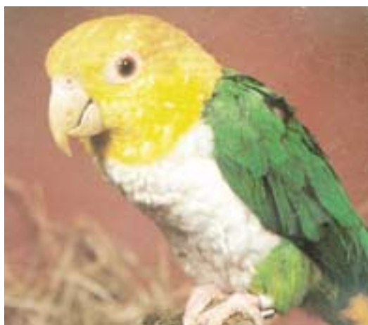
White Bellied Caique

The Club rules have been reproduced at the end of this newsletter.