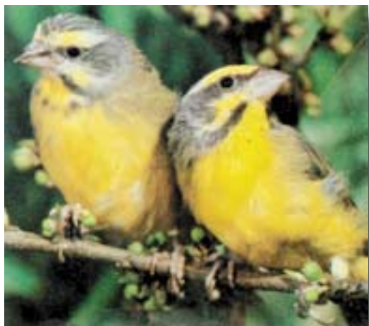
Green Singing Finch

Hen Canary , please phone Murray on 410 3244.