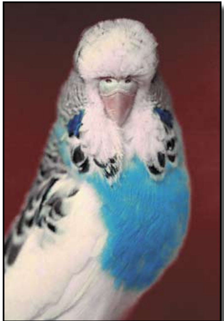
Dominant Pied Skyblue Budgerigar

This newsletter, past issues, membership forms, and other resources and information are on the web at: