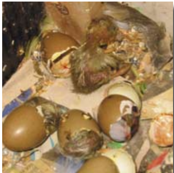
Chinese Quail Hatching

Unfortunately, later that day they died. I think that they were possibly abandoned in the act of hatching and got too cold to "spring into life". So not having bonded with mum in the first few minutes she probably had no urge to take care of them.